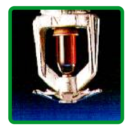
Figure 5 Water sprinkler