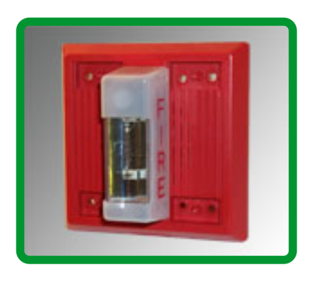
Figure 9 Fire alarm strobe

Visual signaling devices are crucial to notifying occupants who are hearing impaired. Strobes usually incorporate a Xenon flashtube that is protected by a clear protective plastic. They are designed with different light intensities measured in candela units. The minimum flash frequency for these strobes should be once per second.