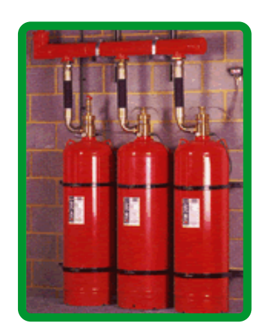
Figure 7 Gaseous agent cylinders

These agents are non-conductive, non-corrosive, and some can safely be discharged in occupied areas. The name "clean agents" is commonly used because they leave no residue and cause no collateral damage. For years Halon has been used as the agent of choice, however, it was phased out in commercial applications due to its ozone depletion properties. We will discuss Halon alternatives in the next section. The standard that guides total flooding suppression systems is NFPA 2001 – Standard on Clean Agent Fire Extinguishing System.