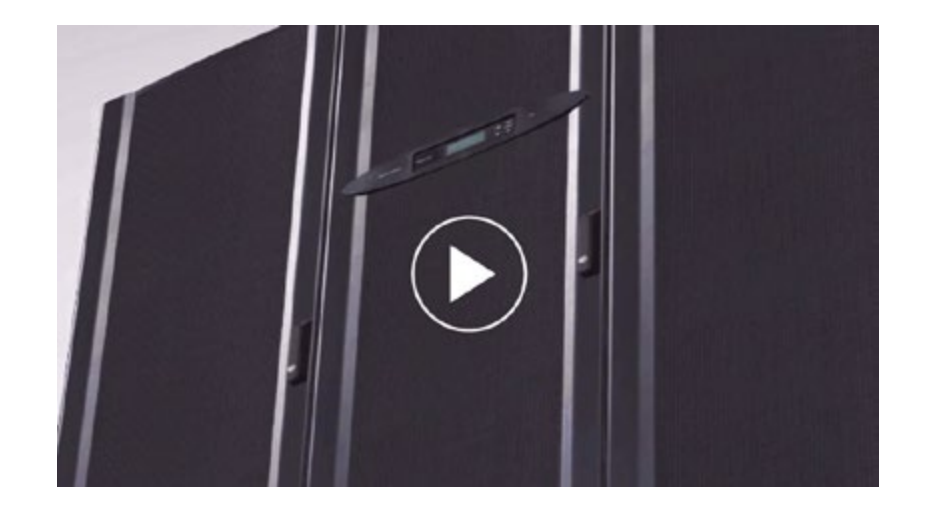
Symmetra PX UPS is truly modular. What do we mean by that? Take a look.

Learn how modularity solves design and installation issues. Download the white paper.