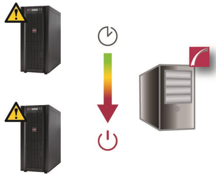
Figure 2 – Two identical configured critical events, one in each UPS will trigger a graceful shutdown of the server with any configured delay time counted down first.

The same configured critical event occurs on UPS 2 and its UPS Network Management Card sends the shutdown notification – the event is logged and shutdown occurs. Any configured delay time will be counted down first.