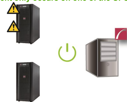
Figure 4 – Critical events in one UPS will not trigger a graceful shutdown of the server if no critical events occur on the second UPS.

If UPS 1 reaches Low Battery and eventually turns off but no events occur on UPS 2 and the UPS stays online, PowerChute Network Shutdown will not begin a shutdown as the second UPS is capable of supporting the entire load itself.