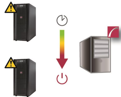
Figure 3 – Two different critical events (whether configured or not), one in each UPS will trigger a graceful shutdown of the server. A 10 second shutdown delay is counted down first.

A different critical event (such as UPS Turn Off Initiated) occurs on UPS 2, its UPS Network Management Card sends the shutdown notification – the event is logged and shutdown occurs. As the critical events are different for both UPS's, a 10 second shutdown delay is counted. No other shutdown delays are counted down.