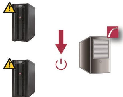
Figure 1 – Two identical critical events, one in each UPS will trigger a graceful shutdown of the server with no shutdown delay counted.

UPS 1 reaches a critical event such as Low Battery; the UPS Network Management Card in that UPS will log the shutdown notification - no event is logged, no shutdown occurs. The same critical event occurs on UPS 2 and its UPS Network Management Card sends the shutdown notification – the event is logged and an immediate shutdown occurs. No shutdown delay is counted.